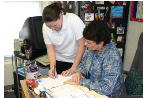
Great students and great teachers!

along with the Graham family, the 100 year birthday of George Beverly Shea . Mr. Shea and Dr. Graham served together in their